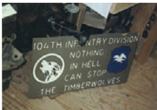
At the Achtmaal WW-II Museum