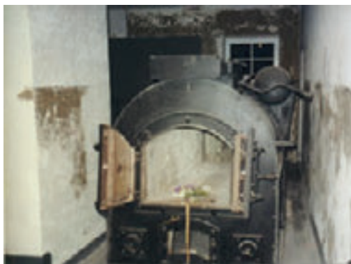
One of the two crematorium ovens in the Dora Mittelbau slave labor camp (Nordhausen)

Next we were shown the building containing the two ovens used for cremating the dead bodies. We also learned that the building housing these ovens had been mounted deliberately on top of a small hill so that ashes from the ovens could be dumped and would slide down the hill. Over the year or two of this operation, the hill grew in size. After liberation, grass was planted over the ashes, and today the hill looks like a normal hill.