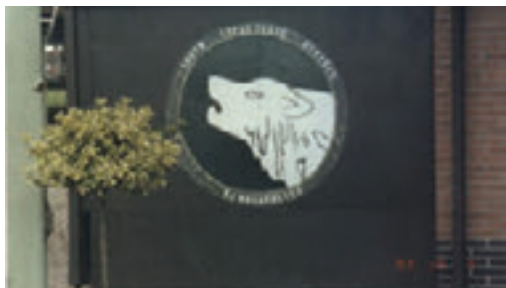
The Oostvogels (Achtmaal, Netherlands) Timberwolf (WW-II) Museum