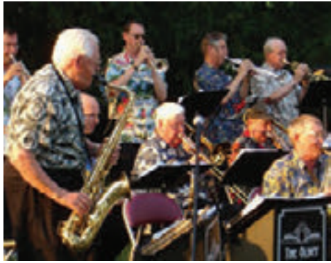
Rip playing at BGRV with the Olney Big Band, June 17, 2007

and nearly 2,500 copies had been distributed through 2010. Several additional CDs and a DVD of one of the OBB's Olney Theatre Swing! Swing! Swing! concerts are now available as well.