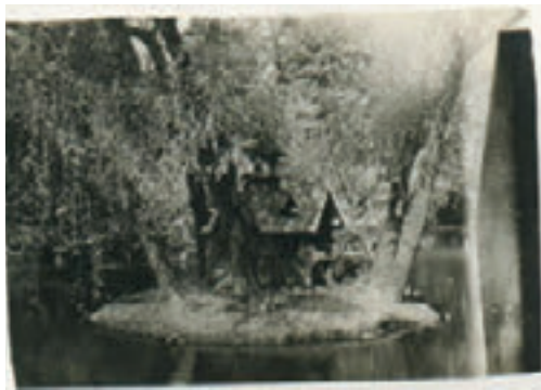
The Delitsch swan house, 1945

Below are photos of that island, taken in April 1945 (b/w) from one side of the river, and again in late 2002, taken from the other side of the river. Nothing seems to have changed with the scene.