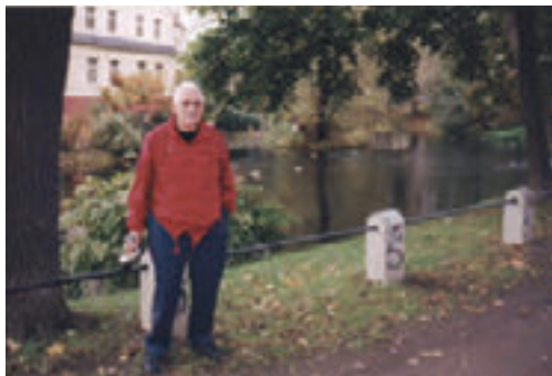
The Delitsch swan house, 2002