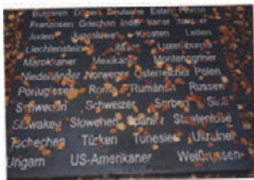
List of countries from which slave laborers were impressed in the Dora slave labor camp

At the base of the hill, however, is a memorial plaque listing the names of countries of slave laborers who were at this camp. Note that “US-Amerikaner” is listed -- meaning that there were some Americans who had been impressed into slave labor status to help build the German rockets.