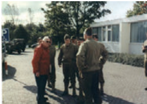
Rip with Dutch Timberwolves, 2002