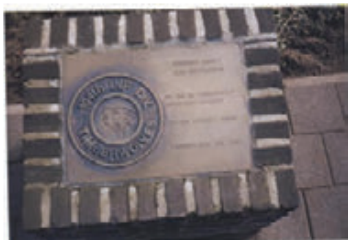
Zundert memorial to the Timberwolves