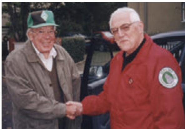
Two former WW-II enemies, now friends and allies