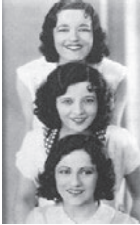
The Boswell Sisters (bottom to top) Connie, Martha and Vet. Recall that Connie had polio and could hardly walk. But what a vocalist!