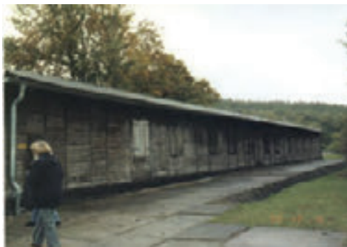
Reconditioned and preserved slave labor barracks at the Dora Mittelbau slave labor camp, Nordhausen