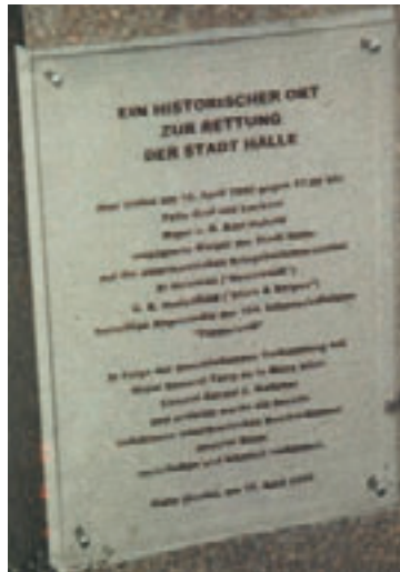
“An historic place for the saving of the town of Halle”